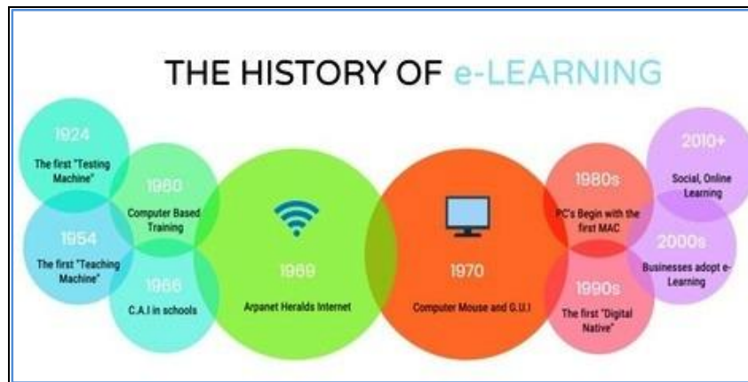
Figure 2: History of EL [12] [17] [18]

In general E-learning (EL) is not a new concept it was started way back in 1924 for basic communication and conducting assessments through the medium of distant learning education. With the development of computer based training in 1980, EL witnessed a drastic development in education section. Below given Figure 2 provides concise but comprehensive stages of development of EL.