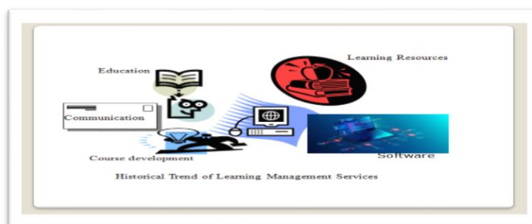
Figure1: History and Trends of LMS [12] [17]