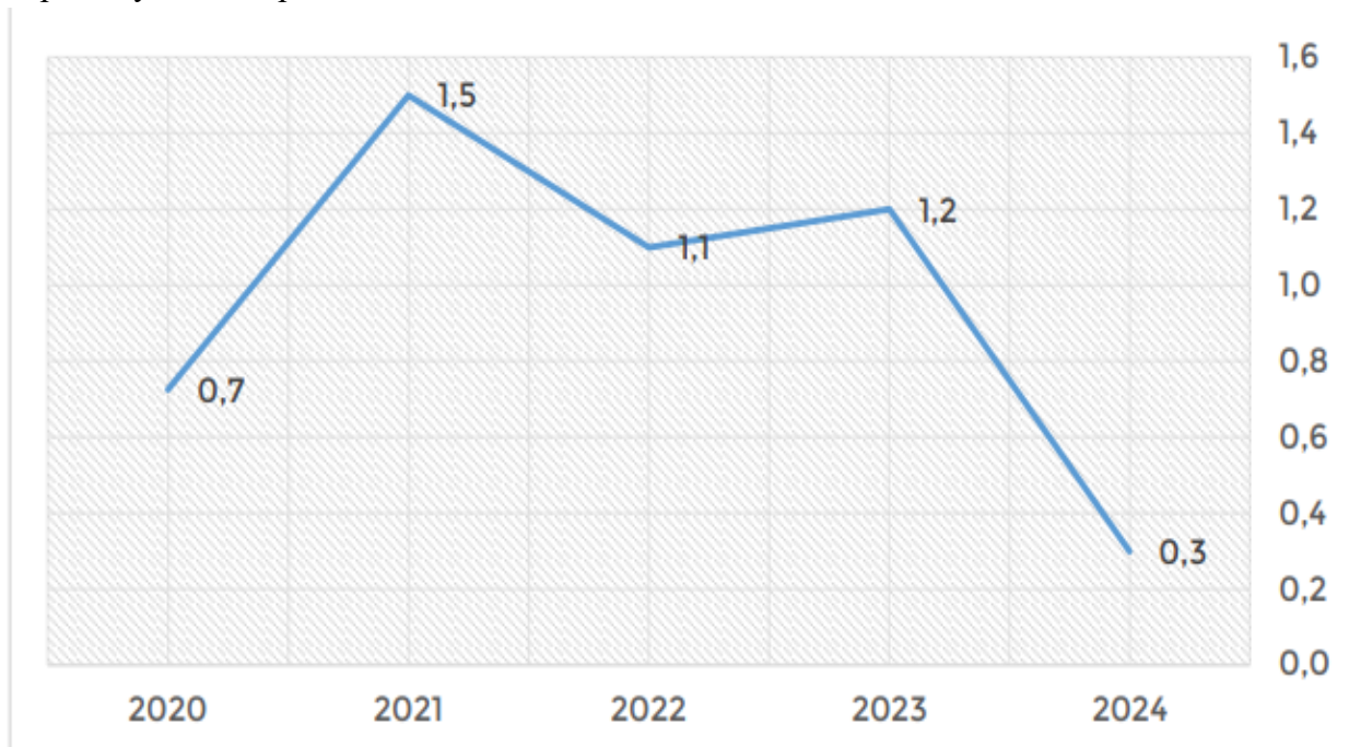
Figure 2. Amount of subsidies allocated to agriculture from the state budget, trillion soums (Ministry of Agriculture, 2025)

Subsidies allocated from the state budget as part of state financial support for agricultural producers will amount to 4.8 trillion soums in 2020-2024 (Fig. 2). The allocation of these subsidy funds is carried out through the Agrosubsidiya information system. The electronic system of allocation of subsidy funds for the production of agricultural products from the state budget is important in ensuring the transparency of these processes and effective use of funds.